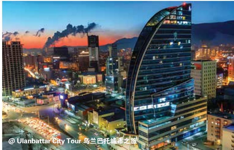
@ Ulanbattar City Tour 乌兰巴托城市之旅

从酒店退房后、前往国际机场。向蓝天之国说“Bayartai”（再见），带着充满冒险和美好回忆的祖国启程。