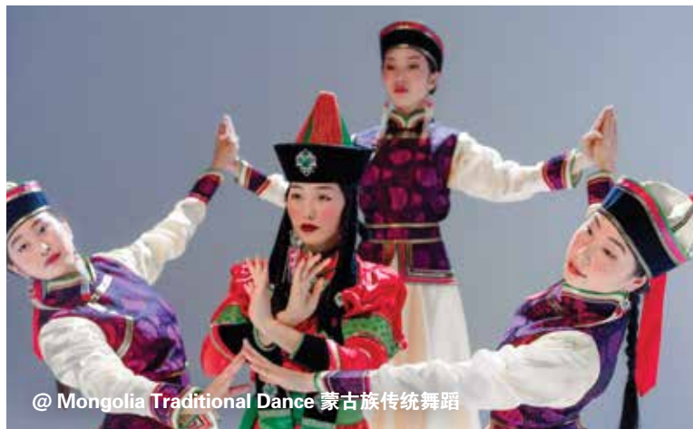
@ Mongolia Traditional Dance 蒙古族传统舞蹈