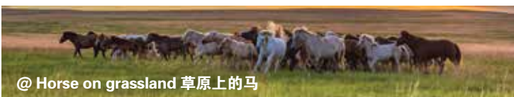
@ Horse on grassland 草原上的马

* Optional horse riding over the grassland at your own expense : Experience horse Riding.