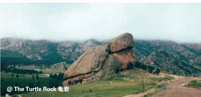
@ The Turtle Rock 龟岩