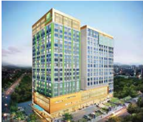
Holiday Inn Hotel 假日酒店