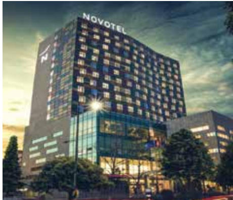
Novotel Hotel 诺富特酒店