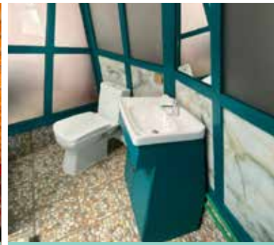
Attached Toilet 附设卫生间