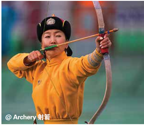
@ Archery 射箭