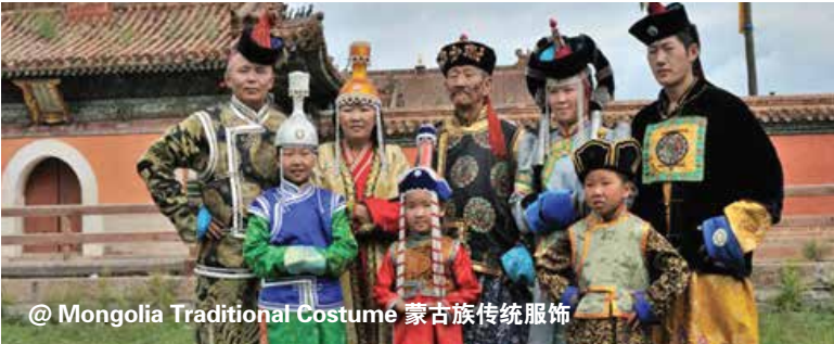
@ Mongolia Traditional Costume 蒙古族传统服饰

※ 羊肉烧烤“Khorkhog” ：将羊肉、羔羊肉或山羊肉与蔬菜和热石一起在大金属容器中烹制。