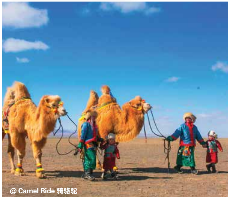
@ Camel Ride 骑骆驼