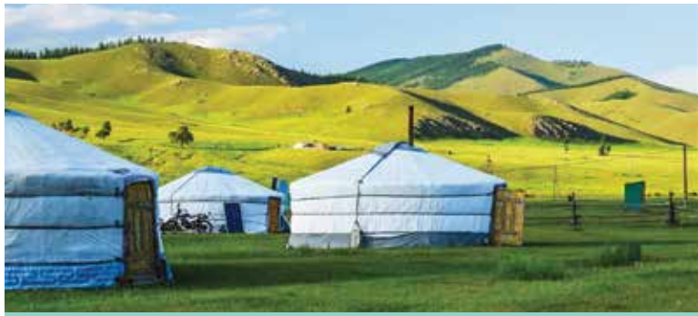
Deluxe Ger Camp 豪华蒙古包