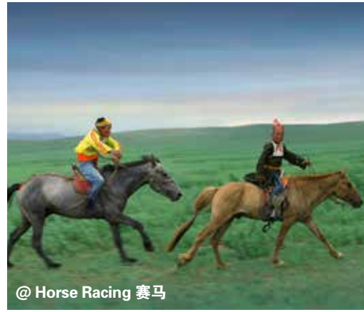
@ Horse Racing 赛马