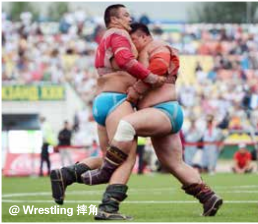
@ Wrestling 摔跤